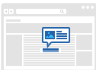
Image ads allow you to create effective branding while conveying information to consumers.